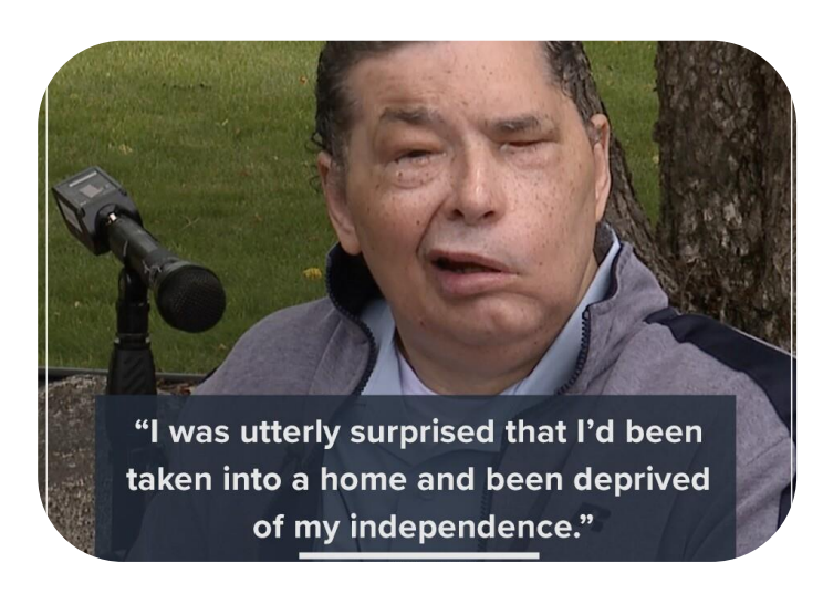
Real Michiganders impacted by the system