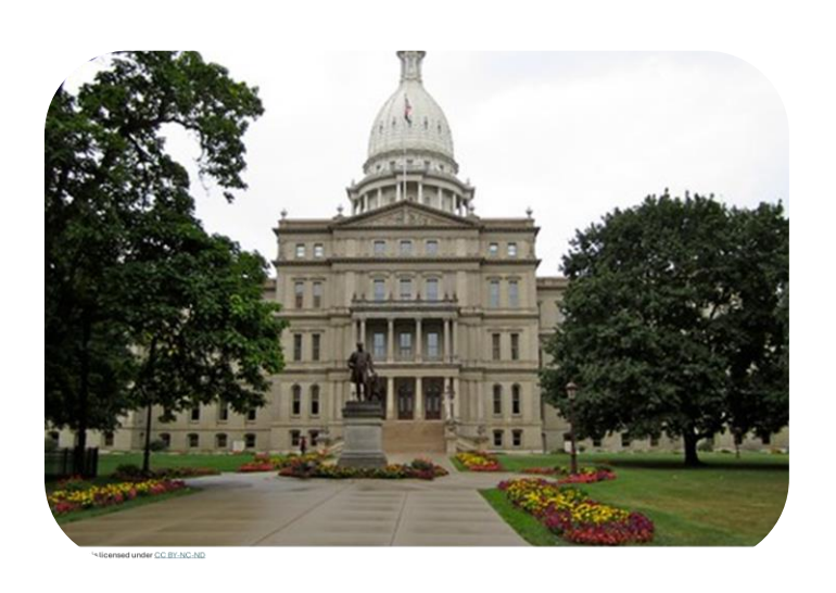
Opportunities for the legislature