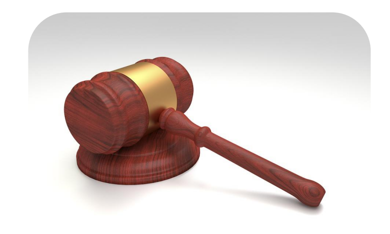
What is EPIC adult guardianship?